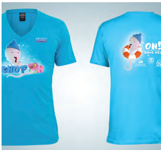
"Chup On" Campaign Merchandising

As one of its highlights for 2015, during the 2015 Carnival Fama Plania held an information, education and communication campaign titled "Chup On". The campaign focused on safe sex behaviors as well as condom use in the prevention of STI's. Foundation staff, volunteers and members of the Board of Directors participated in several activities which targeted both the youth population as well as adults. At events such as the Carnival Queen Elections, the school youth parades and the Grand Parades, the Foundation distributed flyers and condoms (both male and female). These efforts were supported by infomercials on radio and television, in addition to appearances on several talk shows to educate the public on STI prevention, HIV prevention as well as the prevention of unwanted and unplanned pregnancies during the carnival period. To support the Carnival programme, the Foundation was able to secure sponsorship from commercial entities to address costs related to printed materials as well as airtime on television and radio.