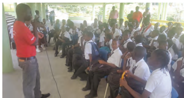
School and community outreaches

The Association was successful in renegotiating with the Ministry of Education and private school boards for access to schools to conduct its Comprehensive Sexuality Education programme. Through this initiative, the Association redesigned its content delivery and found innovated means of delivering its message. Such efforts allowed for access into schools which were never previously accessible, inclusive of church