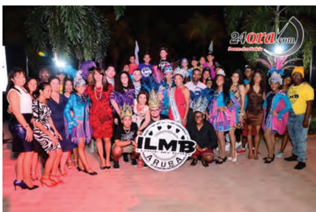
Public launching of 'IPPF Declaration of Sexual Rights' in local Papiamentu language. Among the participants are the Speaker of the house and the Minister with responsibility for social affairs.

FPRP-Aruba continues to demonstrate the power of public relations and marketing on the ability of small associations to increase access to sexual and reproductive health services for people in need. The effect of the public relations initiatives executed by the Foundation has been an enhanced visibility of the Foundation, with more people being made aware of the SRH challenges on the island. As a result, the demand for the services of the Foundation has increased. It must be noted that the Foundation for the Promotion of Responsible Parenthood celebrated its 45th anniversary during 2015. As part of the celebrations, the Affiliate in Aruba launched a publication of the IPPF Declaration of Sexual Rights in the local Papiamentu language.