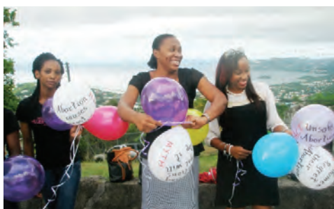
Abortion awareness day activity