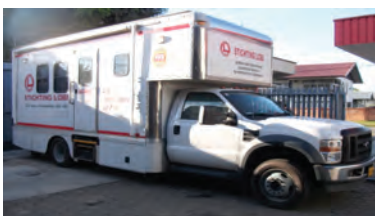
LOBI's mobile outreach

The Adolescent-IEC-Program implemented, involved education sessions in schools as well as out of school activities and training for drop-outs and non school youth through outreach activities, field visits, fairs and dissemination of printed information & education materials, production of audio visual materials such as pamphlets, posters, etc. During 2015, Lobi continued its efforts to train youth in sexual and reproductive health issues, to improve their communication skills, to be able to deal better with difficult situations (such as sexuality issues) and to be able to discuss these issues with their peers. Social media greatly aided the work of the association, in delivering desired messages to potential clients and clients alike.