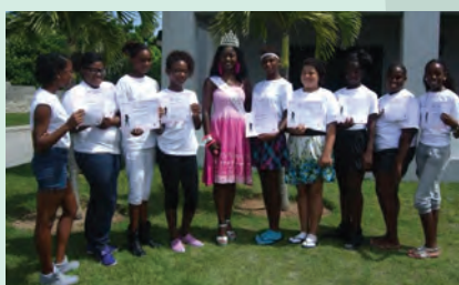
Participants of Precious Gems Summer Camp pose with Ms. Teen Bermuda

prevention-focused community outreach and Teen Pregnancy Prevention Campaign; Teen Haven – transitional housing; Precious Gems summer program; and Outstanding Teen Awards presentation.