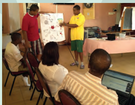
Depicts two young men presenting the findings of their group discussion, Dominica

To reach young people, the association provides sexuality and life skills education in a few secondary schools and to adolescents outside the school system through rap sessions,