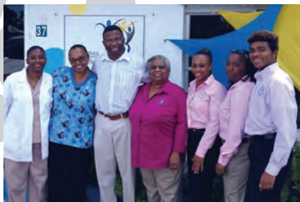
The Executive Director and staff of BaSHRA