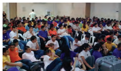
Public launching of 'I Love My Body' campaign (Top), SRH Information session with teens (Bottom), Aruba

The effect of the public relations initiatives of this campaign is that the visibility of the association was significantly enhanced, more people were made aware of the SRH challenges on the island and the demand for the services of the Association increased.