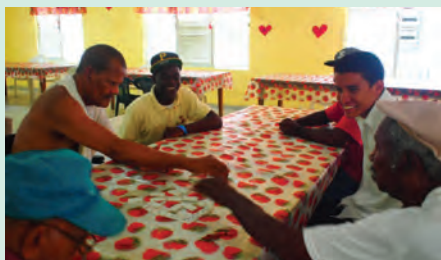
Educational Outreach, Belize (Above)