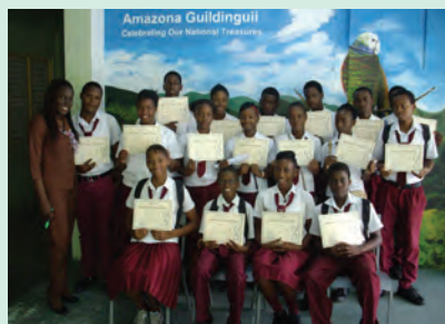
Students who completed the three day training session as part of the Youth Health Conference 2013, Saint Vincent

conflict resolution and membership of the Youth Advocacy Movement.