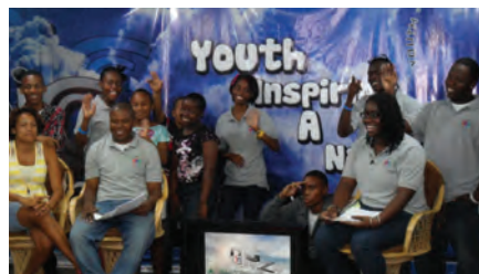
BIGG Chatz-TV/Radio Show, Belize

From the text messages, facebook, verbal feedback and e-mails received, it is believed that a significant number of adults view