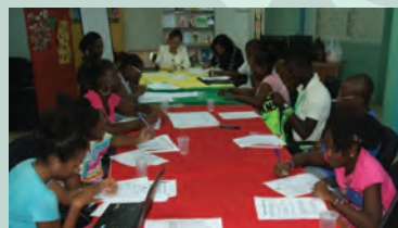
Members of the Youth Advocacy Movement at work

field visits, fairs and dissemination of printed information & education materials, production of audio visual materials such as pamphlets, posters, etc.